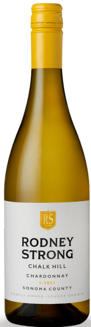
2021 Rodney Strong Chalk Hill Chardonnay Sonoma County