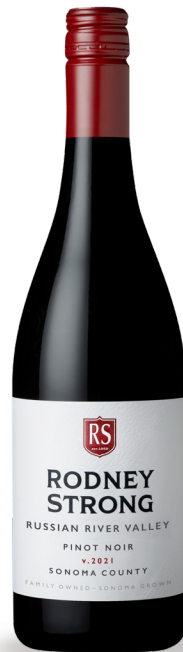
2021 Rodney Strong Pinot Noir Russian River Valley