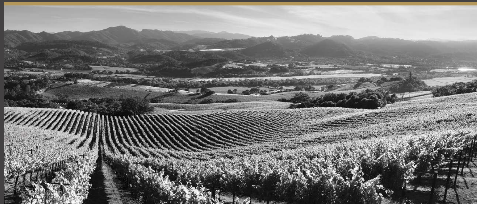
Brothers Vineyard, Alexander Valley

The Bavarian Lion Vineyard in Knights Valley is known for its well drained soils which leads to great growing conditions for Bordeaux varietals — specifically Cabernet Sauvignon and Malbec. Knights Valley is considered benchland as it is higher in elevation than other AVAs, leading to perfect conditions for Malbec which thrives with elevation.