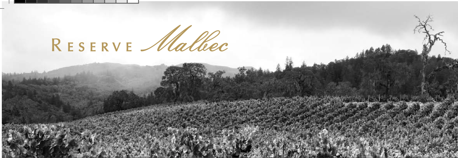
Bavarian Lion Vineyard, Knights Valley

Rodney Strong Reserve Malbec is hand-crafted in our artisan winery from our uniquely situated Sonoma County vineyards.